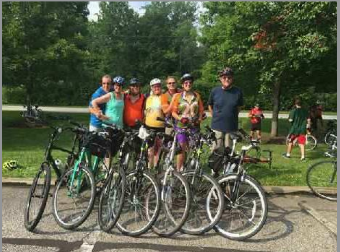
Those bikers are deaf!