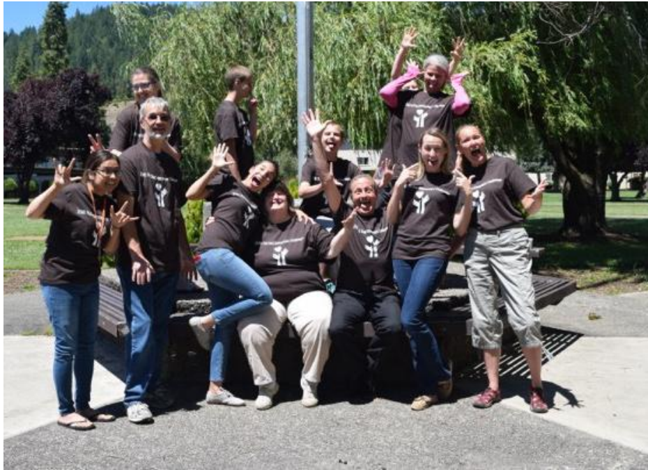
Interpreters pause conference workshops for a silly picture at the flag pole on the campus of Milo Adventist Academy in July.