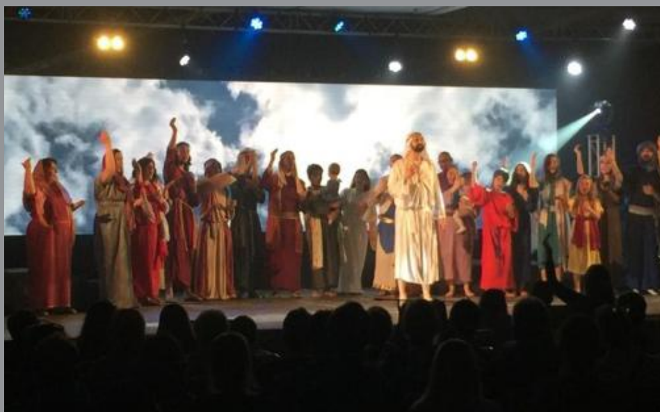
The closing program was a musical performance of Bible stories in sign language.

I’ve given my report of the trip at church a few Sabbaths ago and it will be posted on the SDF website. Also, Larry Evans has posted some pictures you can view by going to the Adventist Deaf Ministries website ( adventistdeaf.org ).